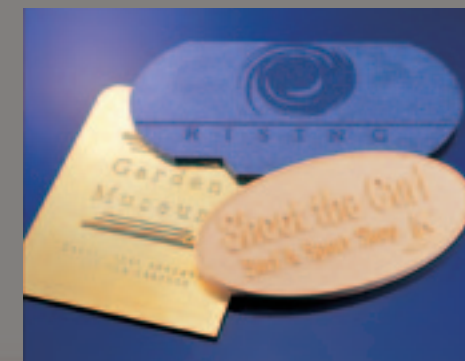
Software : Dr.Engrave