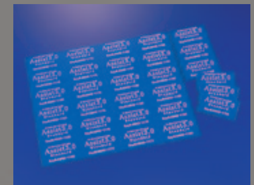
Software : Dr.Engrave