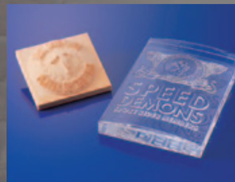
Software : 3D Engrave